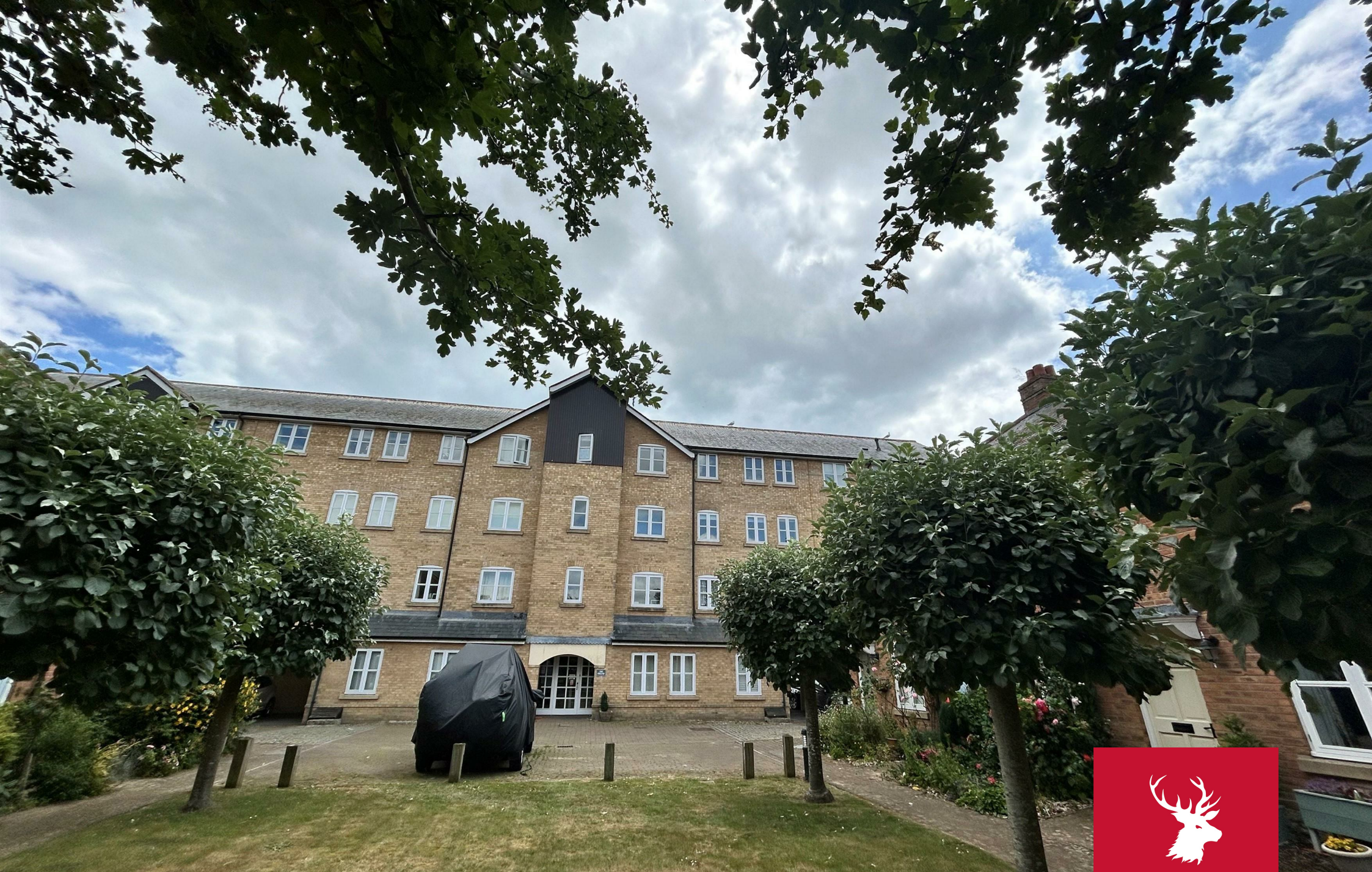
Flat 17, The Strand